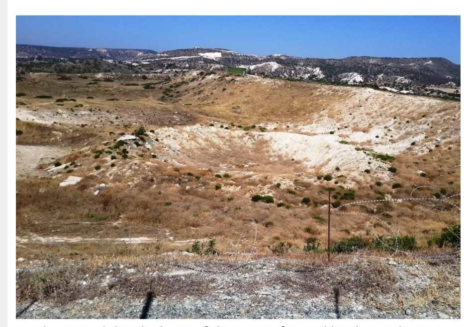
of the crator formed by the explosion

It was 04:30 in Cyprus and a fire started at the Evanglos Florakis Navy Base near Zygi. One hour and 20 minutes later an explosion rocked the area and six naval and six firefighting personnel were dead. A seventh member of the navy subsequently died of his injuries. In the area several houses were destroyed and over 200 damaged. In addition to the dead, 62 people were injured and about 150 people displaced from their houses. The largest power station on the island, Vasilikos Power Station, was 150 yards from the explosion and was badly damaged causing a complete failure of the Cyprus electricity grid. It has been estimated that the explosion was between two and three kilotons ranking it as one of the largest non-nuclear, non-natural explosion in history.