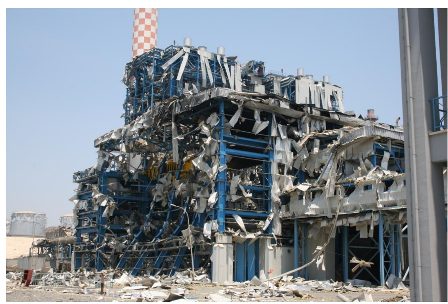
showing Vasilikos Power Station

Offers were made by Germany, the United Kingdom and the United States to assist Cyprus in the removal and disposal of the containers but these offers were declined by the Cypriot government. It was said that the Cypriot President was trying to avoid upsetting Damascus and Tehran by not destroying the munitions. Following the explosion, the Defence Minister and the National Guard Commander-in-Chief both resigned, as did the Foreign Minister a week later, an official independent inquiry was launched and a criminal investigation by the police was commenced. The inquiry said that the President had a "serious, and very heavy personal responsibility" for the blast. The President denied any personal responsibility.