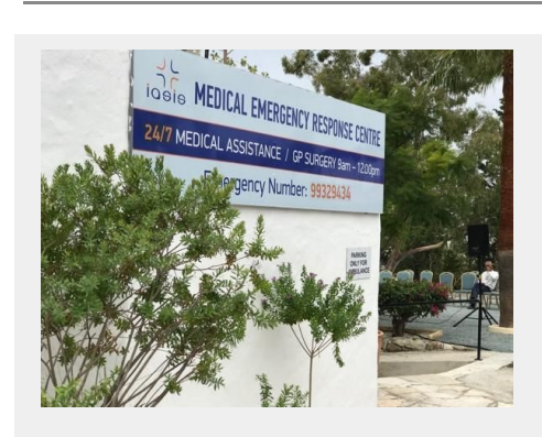
Emergency Medical Centre